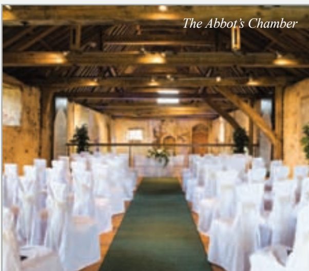
The Abbot's Chamber

This is followed by a scrumptious Wedding breakfast under the vaulted ceiling in the main hall. Then into the gothic and atmospheric cellarium, where you and your guests can dance the night away. A luxurious bridal suite is also available for the perfect end to the perfect day. There are also larger barns for other guests.